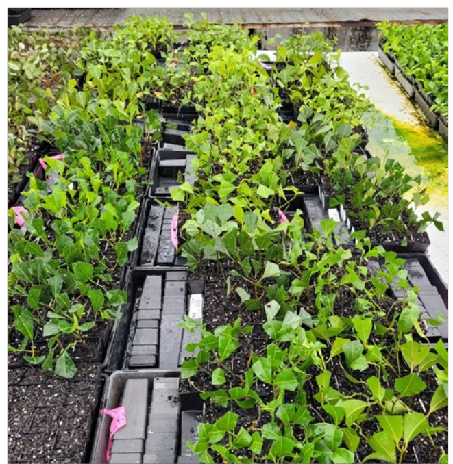
Figure 3. Propagule collections from wild tree populations have commenced.