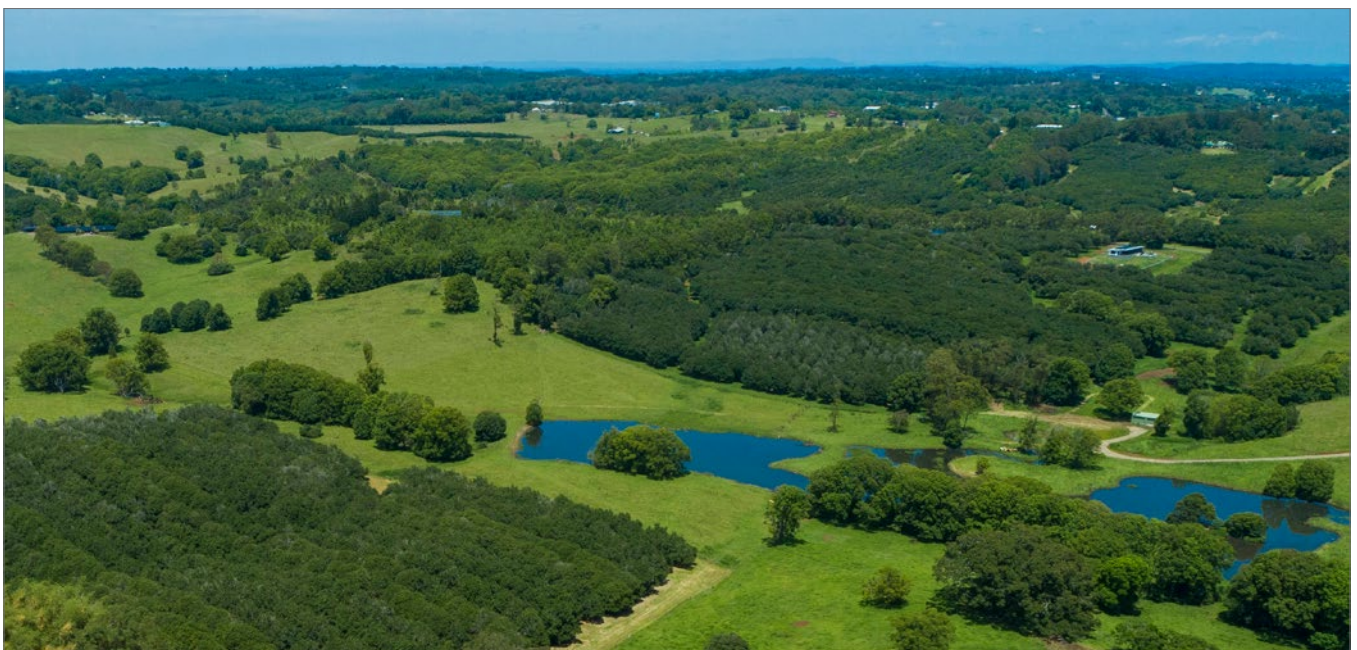
Figure 1. The Living Seedbank Plantation site for the Science Saving Rainforests Program at Macleans Ridges, located in the heart of Big Scrub country.

We have been fortunate to have secured financial support from the NSW Government, from our project partner, Big Scrub Foundation, and from private donors.